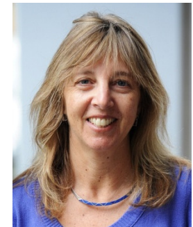
Heather Zar South Africa