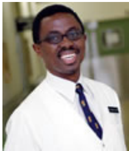
Bongani Mayosi South Africa