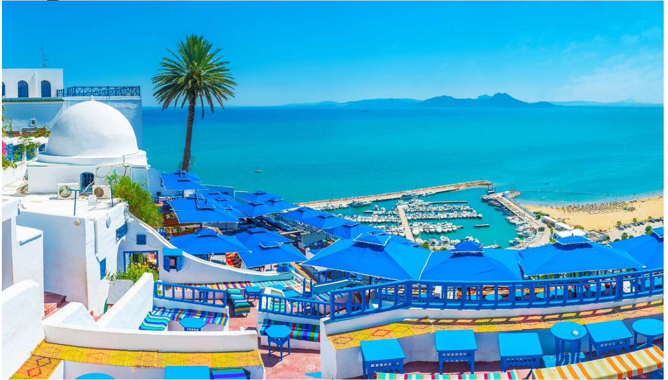
Sidi Bou Said Tunis (20 minutes from the capital)